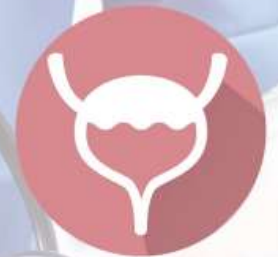
Urinary system support supplement