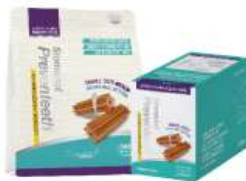
Hydrolytic Dental Gum S-Preventeeth