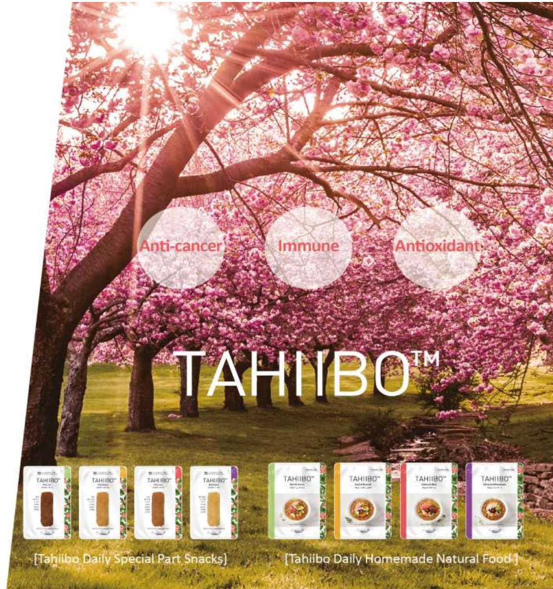
[Taheebo Daily Homemade Natural Food]