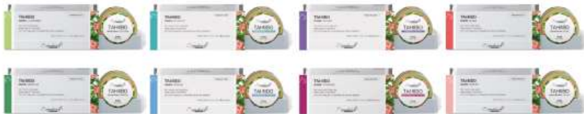
[Taheebo Daily Health Can]

One of the active ingredients in Taheebo, Betalapachone, is well-known for its excellent anti-cancer effects, as it inhibits the growth of cancer cells. It is also known to alleviate loss of appetite when used alongside chemotherapy. Additionally, it has functions such as immune enhancement, anti-inflammation, antioxidant, and blood sugar regulation, with no known side effects reported to date.