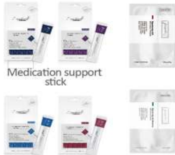
Medication support stick

A product that promotes energy recovery with high digestive absorption and amino acids