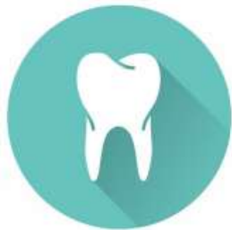
Oral support supplement