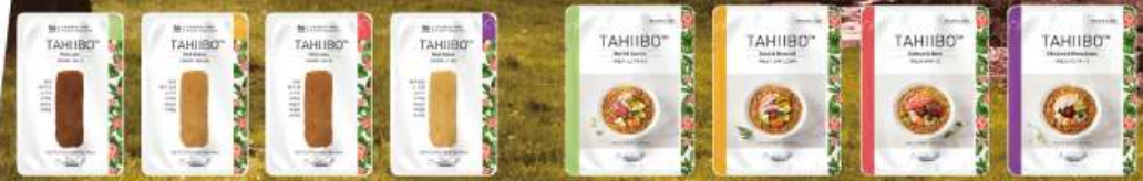
[Taheebo Daily Special Part Snacks]