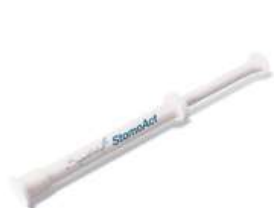
[SeomoAct Oral Gel- 1g]

As the stage of dental condition worsens, an inflammation care oral gel that provides immediate relief from oral unflammation and pain in dogs and cats