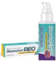
Topical Enzyme Toothpaste-BEO

As an initial step in dental care, only using the toothpaste can help with bad breath and plaque management along with the 500-dalton enzymatic hypoallergenic dental gum