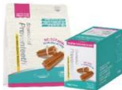
Hydrolytic Dental Gum M/L-Preventeeth