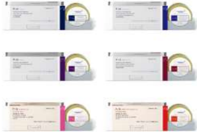
Medication support can

A specialized supplementary medication with low fat content to minimize drug interactions