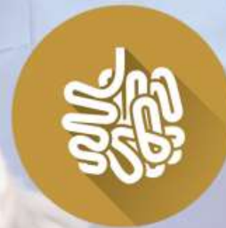
Digestive system support supplement