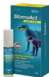
[SeomoAct Oral Gel- 10g]