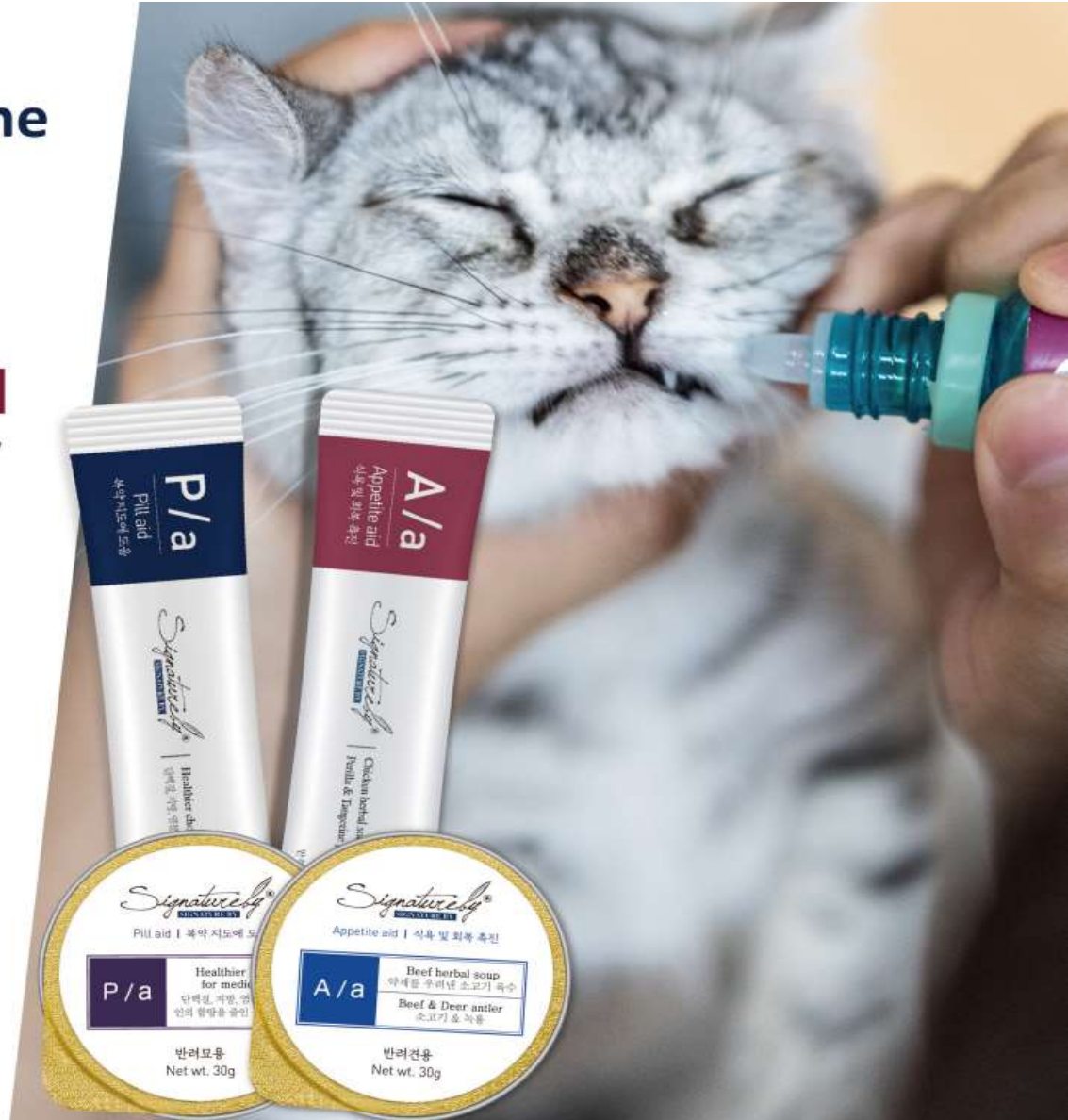
Post-surgery recovery meal