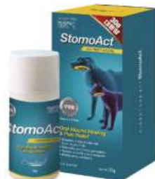
[SeomoAct Oral Gel- 30g]

Immediate relief for oral pain upon application, StomoAct Oral Gel , designed for oral sores