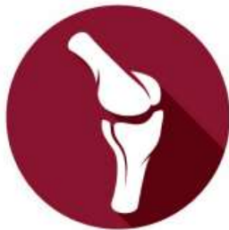
Liquid joint support supplement